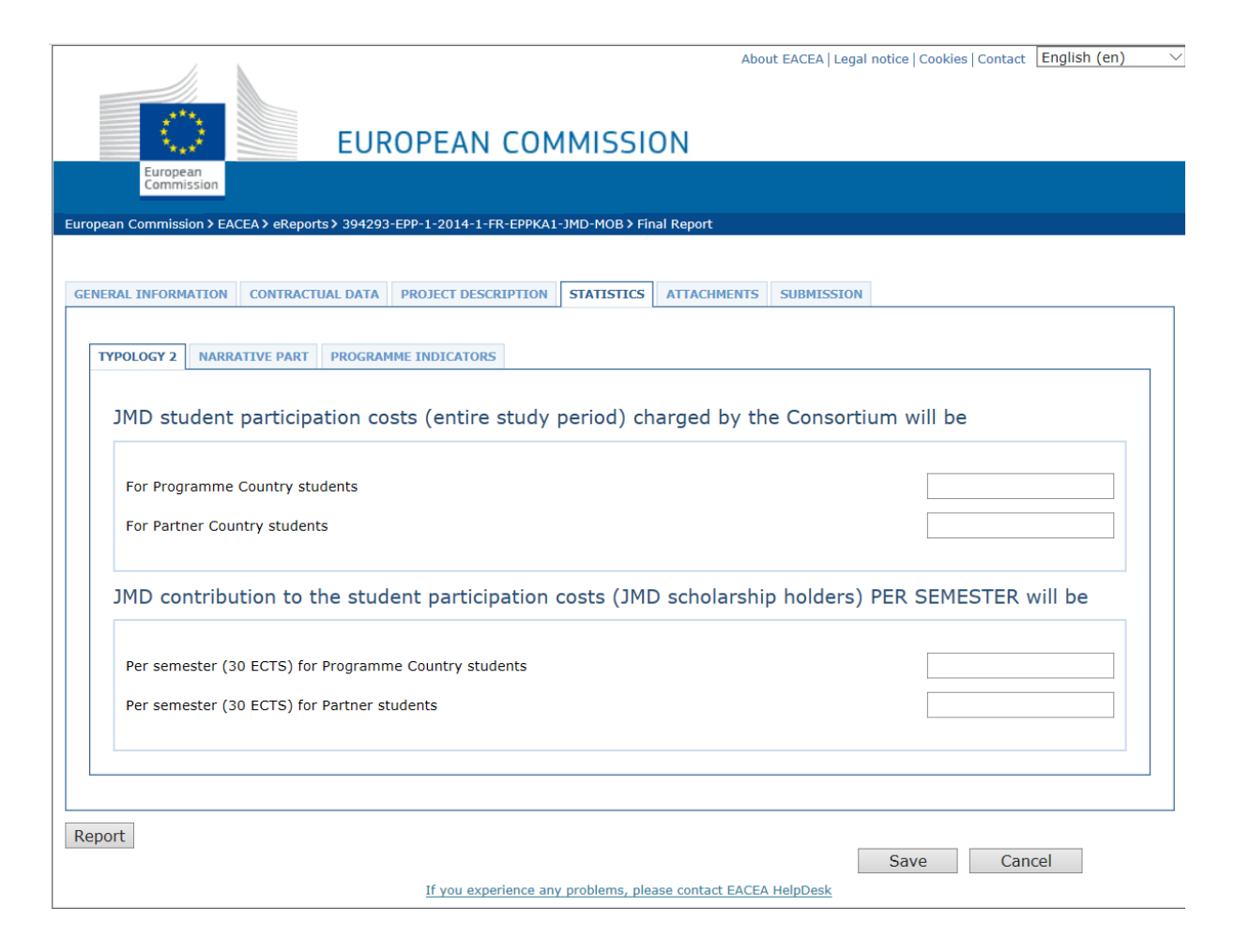
Typology 2 : The data under this sub tab relates to Participation Costs. Please fill in the data.

Note that the data under this tab relates to Participation Costs. Please indicate the Participation Costs per entire study period and per semester (per scholarship-holder).