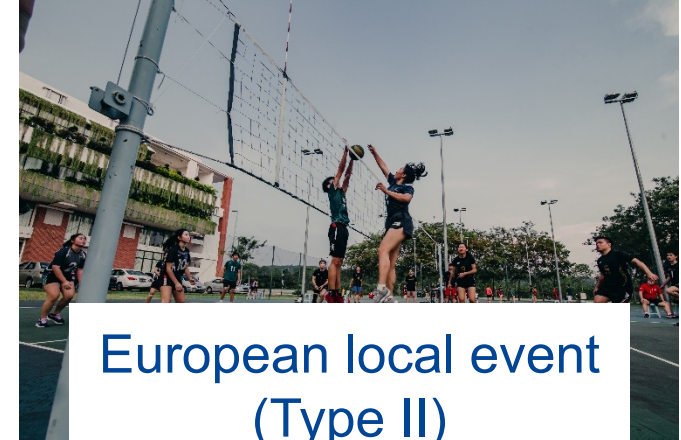
European local event (Type II)