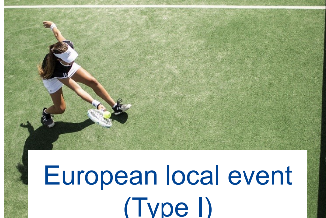
European local event (Type I)